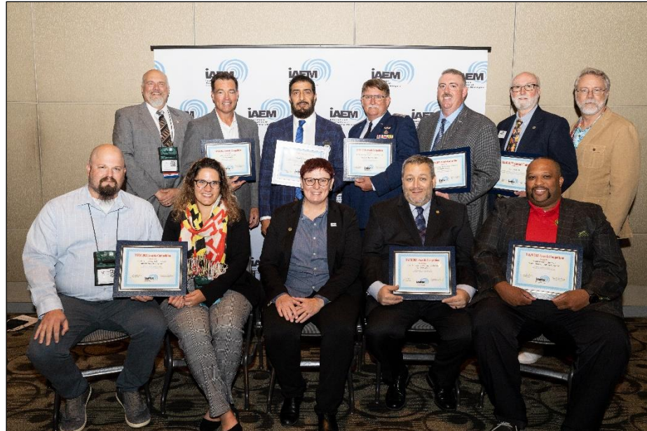
Award Winners 2021 Conference